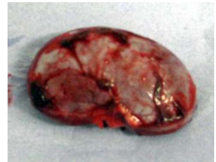
The Kidney is removed