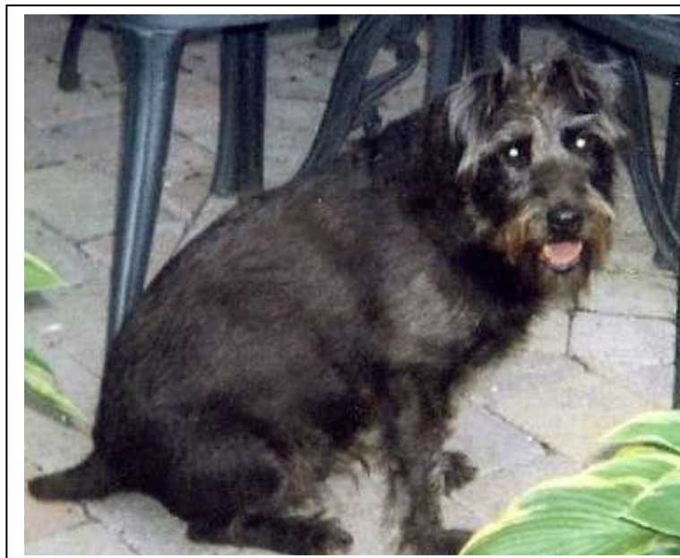
Keeper Dutton November 2009