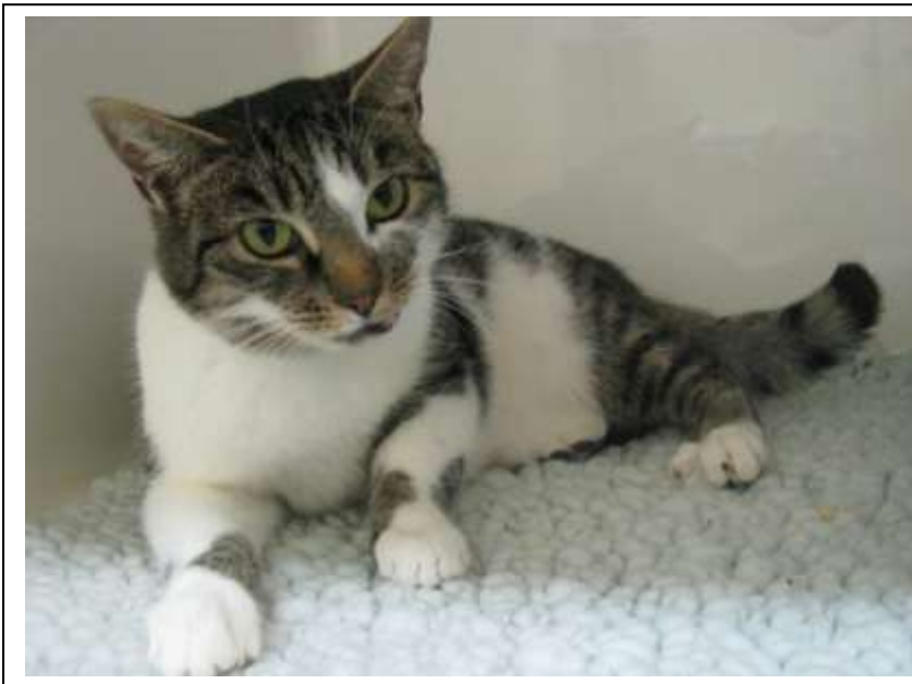
Poppy Young December 2009