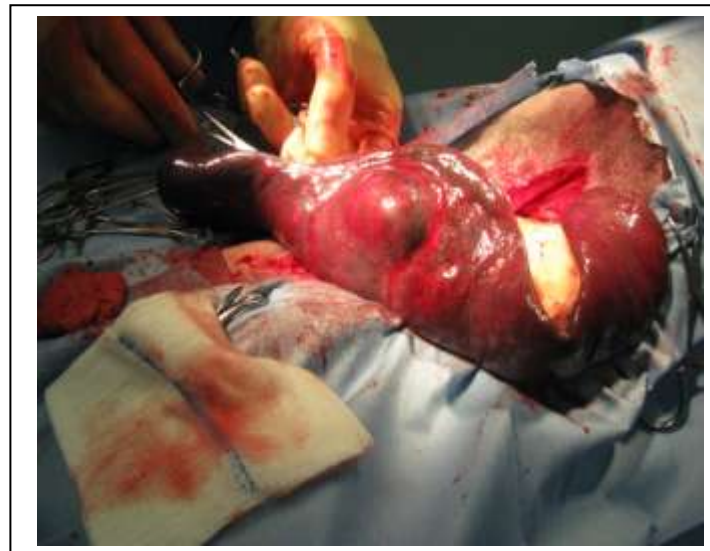
The Spleen is removed