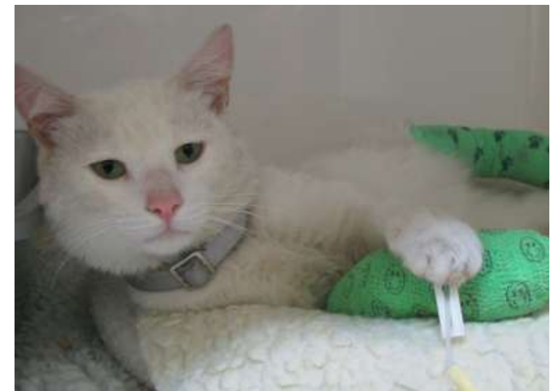
Chester Greatorex August 2009