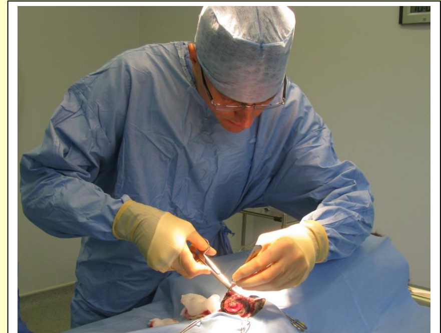
Keeper is anaesthetised. The area is clipped and cleaned in preparation for surgery and Matt operates to remove the mass.

Keeper's case shows that anaesthesia in older patients is safe and worth while to improve quality of life.